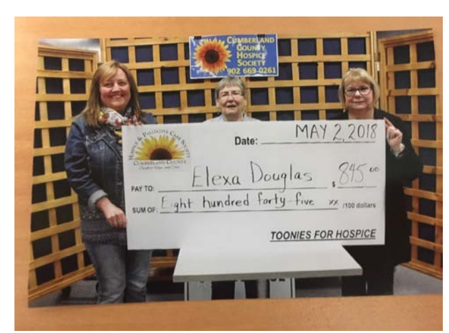
Toonies for Hospice

2018 has been a very eventful year at Cumberland County Hospice Palliative Care Society. Our mainfocus this year has been raising awareness for the Hospice Society in all of Cumberland County. The citizens of Cumberland County not only need a hospice, they deserve a hospice. Everyone has the right to die with dignity, surrounded by their loved ones, in a setting of their choice. Everyone in Cumberland County needs to understand what the Hospice Society is about and why we are fighting so hard to gain approval from the Provincial Government. We have made presentations throughout the County, speaking to Lions Clubs in Amherst and Parrsboro, Springhill Senior Citizens Group, the Federal Superannuates National Association, Parrsboro Community Breakfast for Hospice Radio, Leamington, Mapleton, South Brook Sewing Circle and the End of Life and Estate Planning Seminar hosted by On Feb 3, 2018, Acacia Lodge #8 hosted a breakfast with all Campbell's Funeral Home.